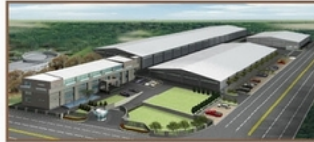
• New manufacturer construction will be completed in the middle of 2008

Capacity: 5500 units (per annual, in 2008's)