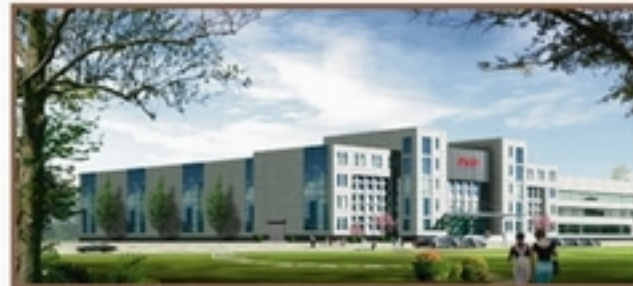
• New manufacturer construction will be completed in the middle of 2008

Capacity: 8500 units (per annual, in 2008's)